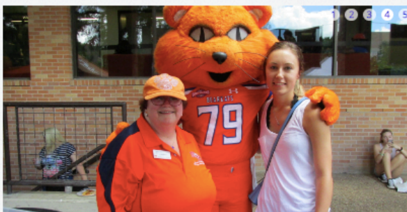
Game of Life Scholarship Winner!